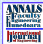
Annals of Faculty Engineering Hunedoara International Journal of Engineering