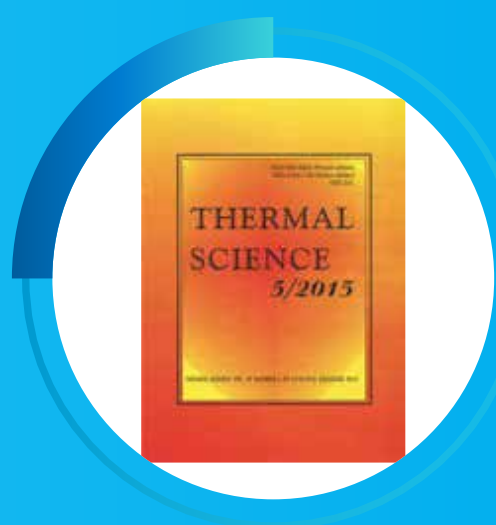
Thermal Science International Scientific Journal