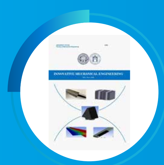
Innovative Mechanical Engineering